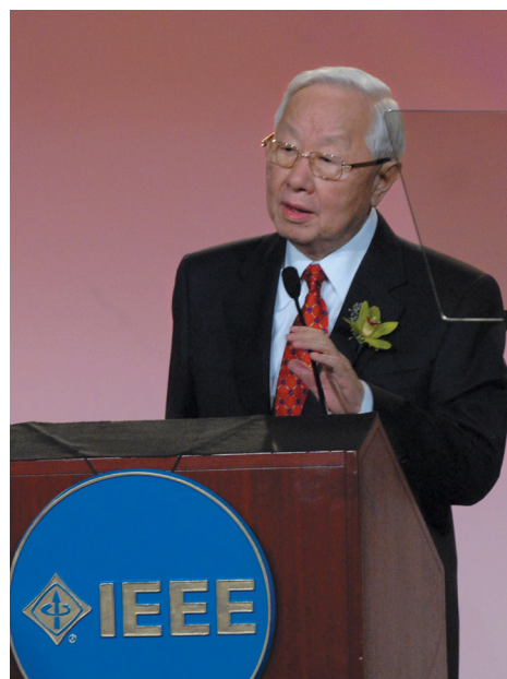
Morris Chang 2011 IEEE Medal of Honor Recipient